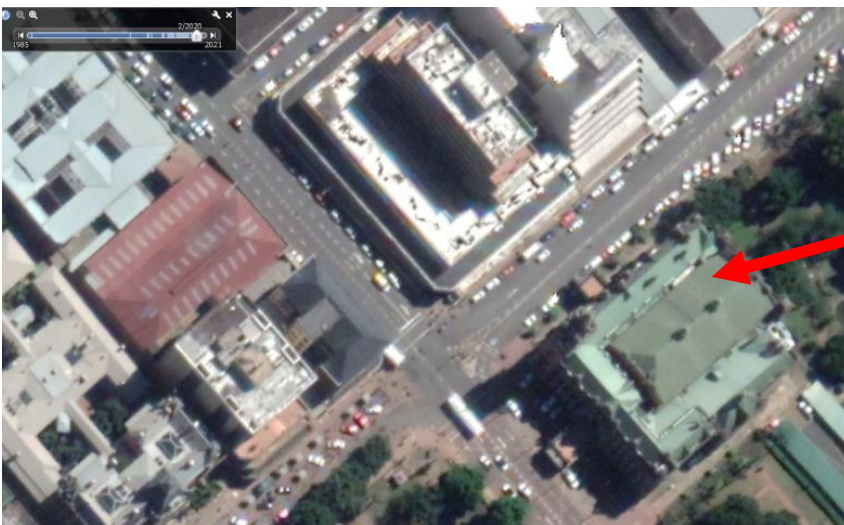
February 2020: Roof is intact