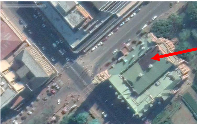
July 2020: Half the copper roof has been stolen